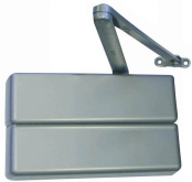
4040XP.TANDEM.1.US28 Hinge (Pull Side) Mounting (Handed)

Best suited to heavy duty situations on perimeter and internal doors (<272 kilos) where accessibility is not an issue.