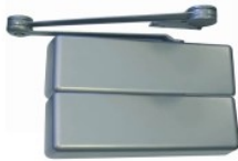
4040XP.6.TANDEM.US28* Stop Face (Push Side) Mounting (Handed)*