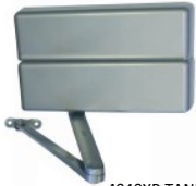
4040XP.TANDEM.61.US28 Top Jamb (Push Side) Mounting (Handed)