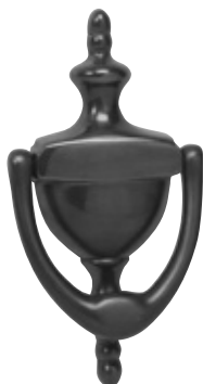
Meets ANSI/BHMA A156.16 L23161

Only B3, B15, B26D and 716 knockers are available with viewer. B3 is furnished with B4 (606) viewer, 716 is furnished with B10B viewer, B15 (619) is furnished with a 636 viewer.