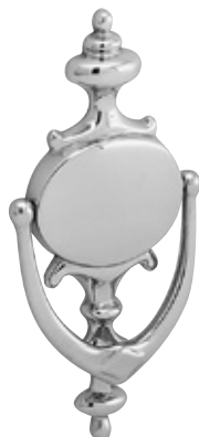
Meets ANSI/BHMA A156.16 L23151